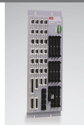
SPiiPlus Breakout Box for easy integration and cables connection

ACS Motion Control Ltd. Ramat Gabriel Industrial Park, POB 5668, Migdal Ha'Emek 10500, Israel Phone: +972-4-6546440 Fax: +972-4-6546443